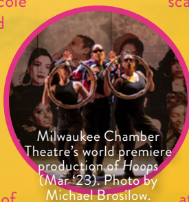
Milwaukee Chamber Theatre's world premiere production of Hoops (Mar '23).