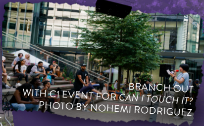
BRANCH OUT WITH C1 EVENT FOR CAN I TOUCH IT?