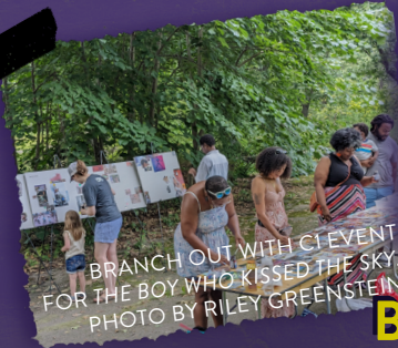
BRANCH OUT WITH C1 EVENT FOR THE BOY WHO KISSED THE SKY.

When you come to a C1 production, you're getting more than just a good show. We connect with partners from across Boston on every production to highlight crucial conversations and action steps through post-show conversations, lobby installations, civic engagement opportunities, and more!