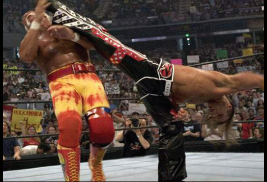
Shawn Michael's signature move – a superkick dubbed Sweet Chin Music

THREE-COUNT – When the referee slaps the mat with his hand to count a pinfall.