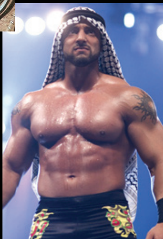
Muhammed Hassan (right) is known for his controversial match that aired on Smackdown, where he called in a gang of masked men to choke his opponent, the Undertaker, with piano wire. The pre-taped segment was taken by critics as a metaphor for al-Qaeda in Iraq's beheading of its hostages, and aired the same day as the London subway bombings in 2005.