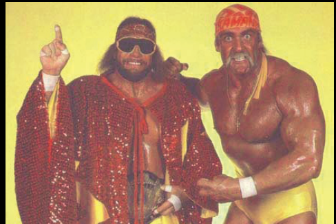
"MACHO MAN" RANDY SAVAGE AND HULK HOGAN, TWO OF THE WWF'S BIGGEST STARS

McMahon had a vision that pro wrestling could go national and set out to turn a regional operation into a major brand. He re-named the promotion World Wrestling Federation (WWF) and called his product "sports entertainment" - emphasis on the entertainment. By leveraging new developments in cable and closed circuit television, McMahon broke from the regional model and syndicated WWF across the country. Stars like Hulk Hogan, Andre the Giant, and Ricky Steamboat headlined weekly matches and pay-per-view events like WrestleMania drew huge crowds. A WWF and