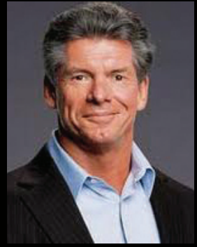
VINCE MCMAHON, CHAIRMAN OF THE BOARD AND CHIEF EXECUTIVE OFFICER OF WWE, INC.

Source: Nielsen Media Research (12/26/11-3/25/12)