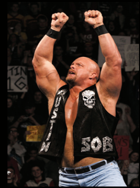
"STONE COLD" STEVE AUSTIN AND THE AT- TITUDE ERA GAVE THE WWE A NEW EDGE

Over the last decade, wrestling's popularity continued to grow. In addition to weekly cable programs and pay-per-view events, over the past few years WWE has launched its own online social network, reality show, webseries, and has even branched into film with WWE superstars like John Cena. The most recent WrestleMania XXVIII garnered 1.3 million pay-per-view buys and had global gross sales in excess of $67 million, smashing attendance and viewing records. Vince McMahon, who received his own star on the Hollywood Walk of Fame in 2008, has seen his dream of a worldwide wrestling brand come true.