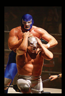
Lucha Libre wrestlers wear distinctive masks

KICK OUT – When a wrestler escapes from a pin or submission hold.