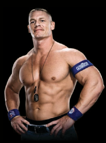
John Cena, one of WWE's most popular "Faces"

- The person in charge of setting up matches and writing angles, the wrestling equivalent of a screenwriter. A